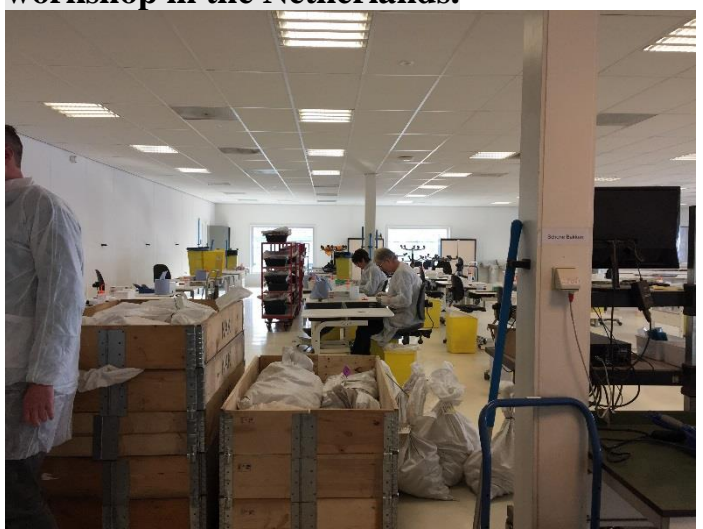
Lab for tuber processing with specialized tables

Susie Siemsen attends molecular diagnostics workshop in the Netherlands.